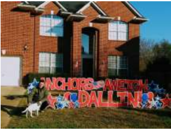
Farewell Party - with his dog, Perry