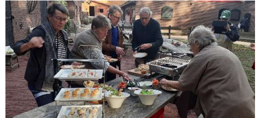
Catering During the Family Day

In 2021 we hope to have another family day. On Saturday, September 4, you are welcome again in IJzerlo for the 25th annual meeting. As last year, we will provide you with food and drink and hope that you will come together for fellowship. Are you planning to come? Then please send an e-mail to info@somsen.org . We will keep you informed about the organization.