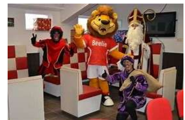
During St. Nicolas fest