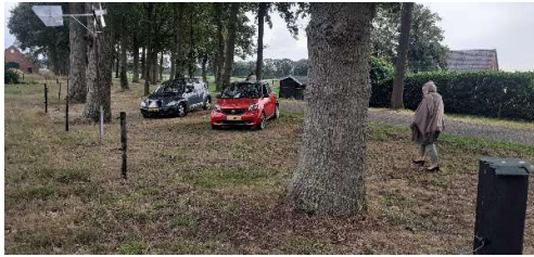
Parking at Jaopikshuis

Despite Corona and the measures that go with it, we were able to hold a family day again last fall. On our familiar spot at Equestrian Center de Achterhoek in IJzerlo where we could meet each other at a safe distance. As always it was a meeting of old and new friends where we exchanged news of the things that have happened the past year. For those present from outside the Achterhoek, it is the opportunity to visit their place of origin again. We also paid our annual visit to our tree, which fortunately is still in good shape. Planted at our first reunion in 1997 this tree has stood there for 23 years at the Jaopikshuis as a witness to our family history.