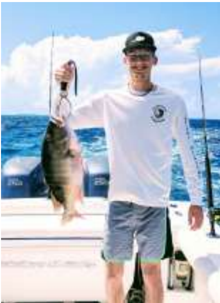
Deep Sea fishing June 2018