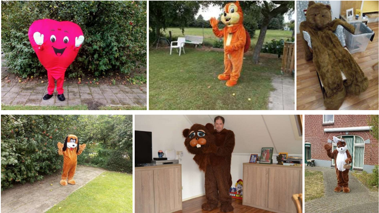
Top (L-R): Heart, Squirrel, Bearsuit. Bottom (L-R): Dog, 'Botje Bever', Easter Bunny