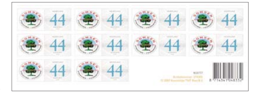
The Somsen foundation stamps

For the philatelists among you: this is already the fourth issue that can be ordered. This was also discovered by other collectors and they wrote about it in their magazine. In Somsen Horizon 23 we will pay attention to it. Seize the opportunity and buy your stamps.