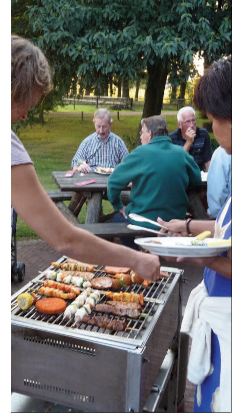
The Somsen weekend in IJzerlo