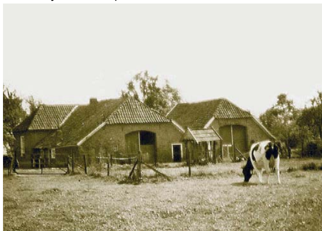
Farm "Den Haank" ca. 1967