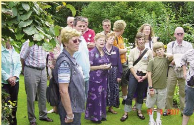
Back to their roots