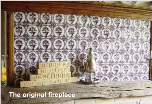
The original fireplace