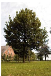
The Somsen lime-tree at the Japikshuis