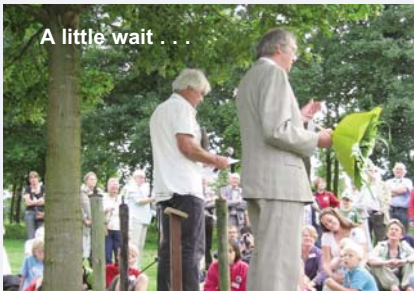
A little wait . . .