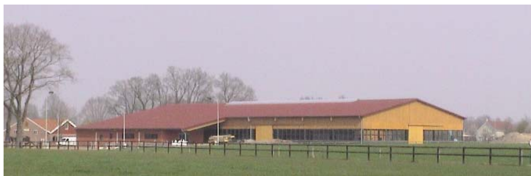
Riding-school "De Achterhoek"