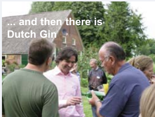
... and then there is Dutch Gin