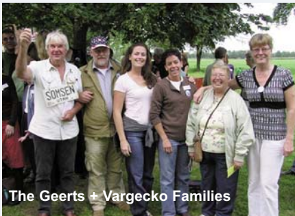
The Geerts + Vargecko Families