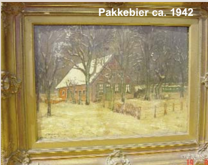
Pakkebier ca. 1942