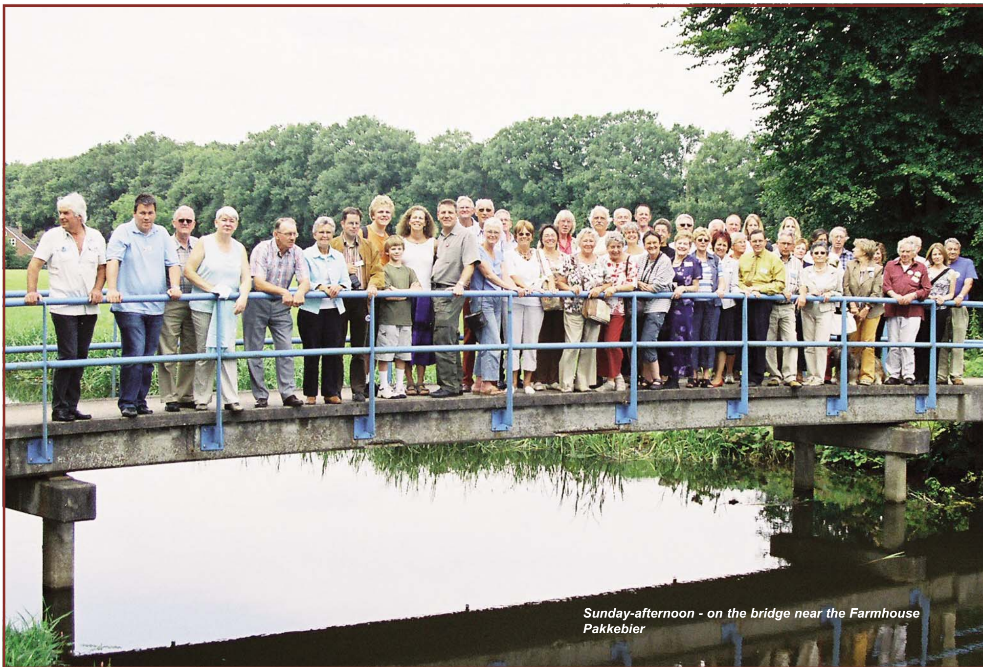
Sunday-afternoon - on the bridge near the Farmhouse Pakkebier