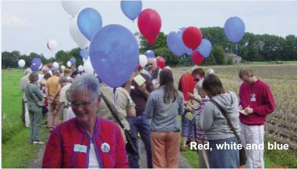
Red, white and blue