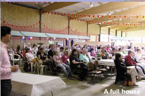
A full house