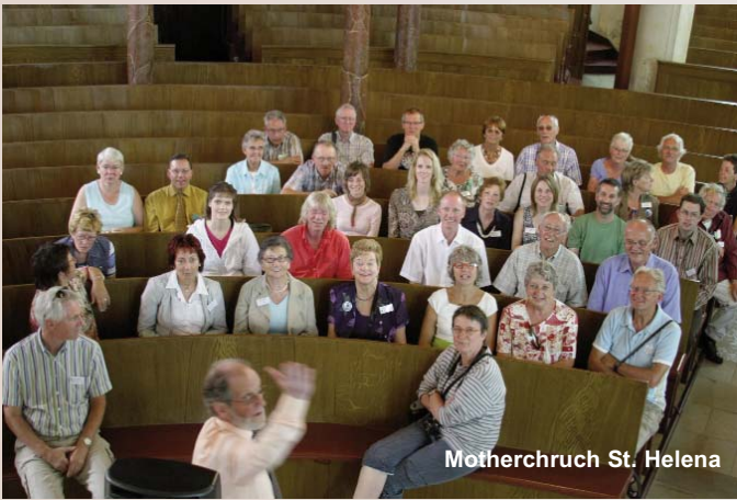
Motherchrch St. Helena