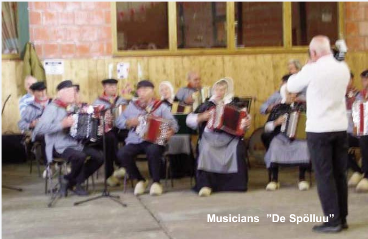
Musicians "De Spöllu"