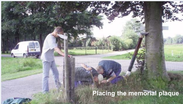
Placing the memorial plaque