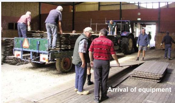
Arrival of equipment