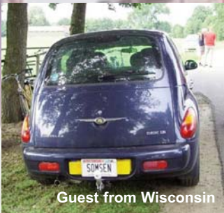
Guest from Wisconsin