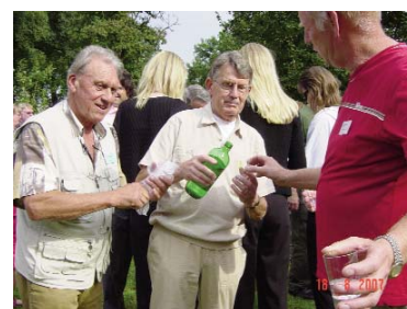
Dutch gin (Jenever)

At the Somsen-house we have revealed a nice commemorative plaque and the countless red, white and blue balloons that were released had to spread the good news. The Somsen lime-tree at the Japikshuis wasn't forgotten either. We all gathered around it, some fine words were spoken to commemorate the first emigrants who left from there, and it was sprinkled with Dutch gin. Well, it wasn't just the tree that got the gin. A small boy had a glass with some, too. "You don't have to drink it", someone said. "No, it's for the tree", he replied earnestly. And he carefully poured it over the tree's roots.