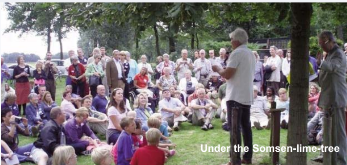
Under the Somsen-lime-tree