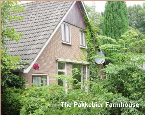
The Pakkebie Farmhouse