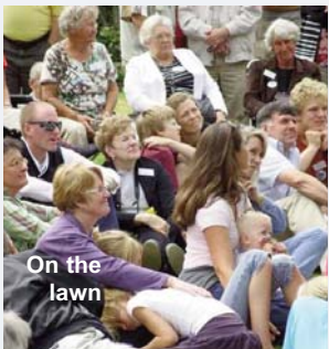
On the lawn