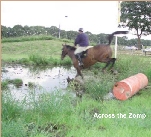
Across the Zomp