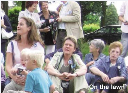
On the lawn