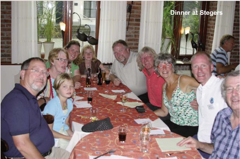
Dinner at Stegers