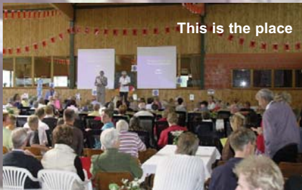
This is the place