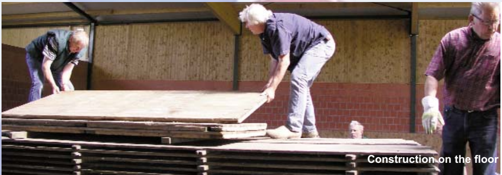
Construction on the floor